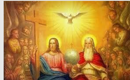
PRAYER, READING, REFLECTION HOW HAVE I IMPLEMENTED THIS TEACHING INTO MY CLASSROOM AND PERSONAL LIFE