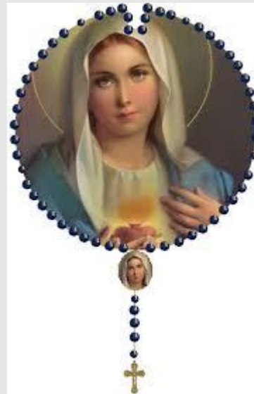
PRAYER, READING, REFLECTION HOW HAVE I IMPLEMENTED THIS TEACHING INTO MY CLASSROOM AND PERSONAL LIFE