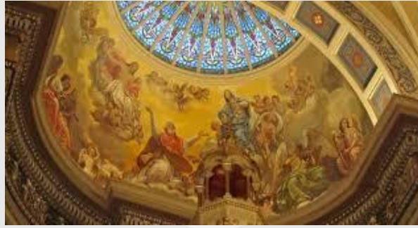
DECEMBER 1, 2020 MY NOTES: