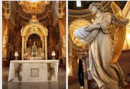
FEBRUARY 2, 2021 MY NOTES: