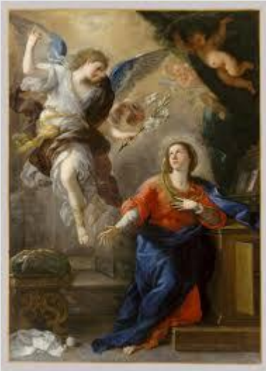
FORMATION MEETING APRIL 20, 2021

Hail Mary Hail Mary, full of grace. The Lord is with thee. Blessed art thou amongst women, and blessed is the fruit of thy womb, Jesus. Holy Mary, Mother of God, pray for us sinners, now and at the hour of our death. Amen