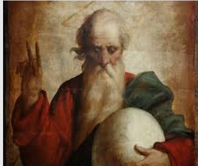
FORMATION MEETING NOVEMBER 3, 2020

Our Father Our Father, Who art in heaven, hallowed be Thy name; Thy kingdom come; Thy will be done on earth as it is in heaven. Give us this day our daily bread; and forgive us our trespasses as we forgive those who trespass against us; and lead us not into temptation, but deliver us from evil. Amen.