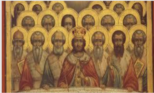
FORMATION MEETING JANUARY 5, 2021

I believe in one God, the Father almighty, maker of heaven and earth, of all things visible and invisible. I believe in one Lord Jesus Christ, the Only Begotten Son of God, born of the Father before all ages. God from God, Light from Light, true God from true God, begotten, not made, consubstantial with the Father; through him all things were made. For us men and for our salvation he came down from heaven, and by the Holy Spirit was incarnate of the Virgin Mary and became man. For our sake he was crucified under Pontius Pilate, he suffered death and was buried, and rose again on the third day in accordance with the Scriptures. He ascended into heaven and is seated at the right hand of the Father. He will come again in glory to judge the living and the dead and his kingdom will have no end. I believe in the Holy Spirit, the Lord, the giver of life, who proceeds from the Father and the Son, who with the Father and the Son is adored and glorified, who has spoken through the prophets. I believe in one, holy, catholic and apostolic Church. I confess one Baptism for the forgiveness of sins, and I look forward to the resurrection of the dead and the life of the world to come. Amen.