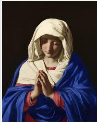
MAY 4, 2021 MY NOTES: