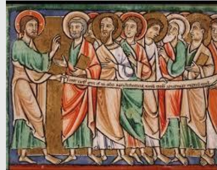
PRAYER, READING, REFLECTION HOW HAVE I IMPLEMENTED THIS TEACHING INTO MY CLASSROOM AND PERSONAL LIFE